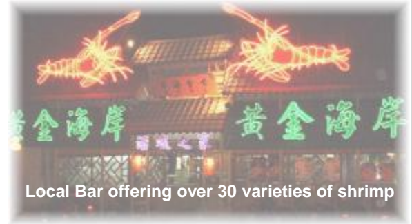
Local Bar offering over 30 varieties of shrimp

Discussions included latest developments and technological advances based around solutions for production issues that you have been asking about.