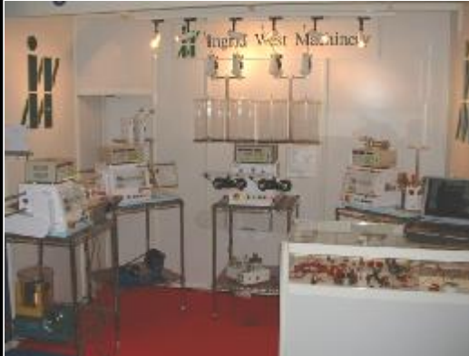
Last year's IWM stand at Productronica 2003