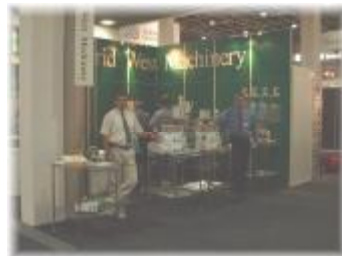
Last year's IWM stand at CWIEME 2003