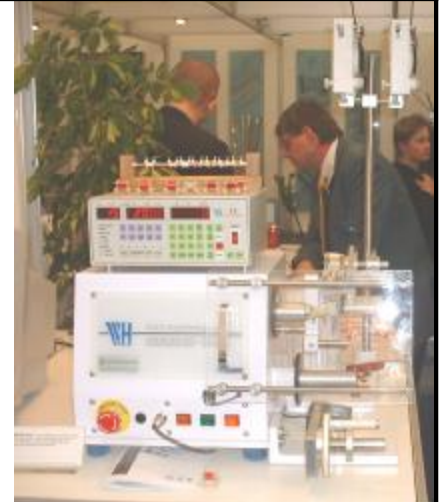
This year's IWM stand at Amper 2004

WHERE - PVA Centre, Prague, Czech Republic