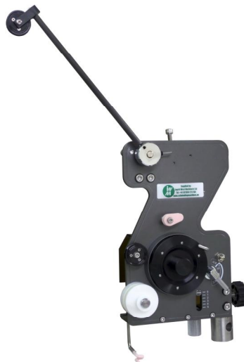
TCL-x heavy wire tensioner