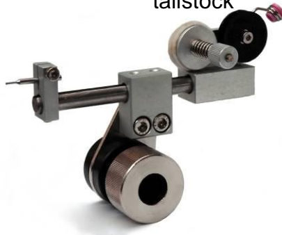
Guide tube feeder head