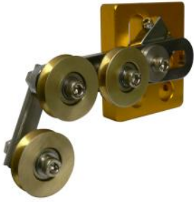
Roller feeder head