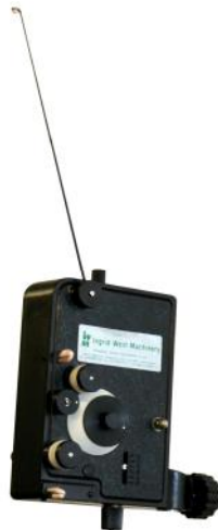
Type "TCS, TCM" tensioner