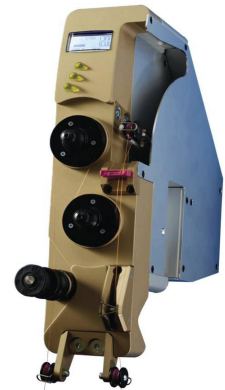
Dual Servo electronic tensioner