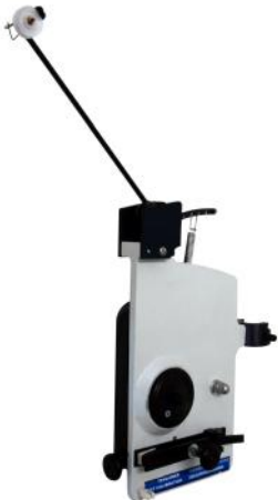
F71 fine wire tensioner