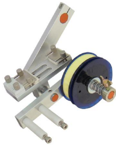
Multi wire feeder head with margin taping