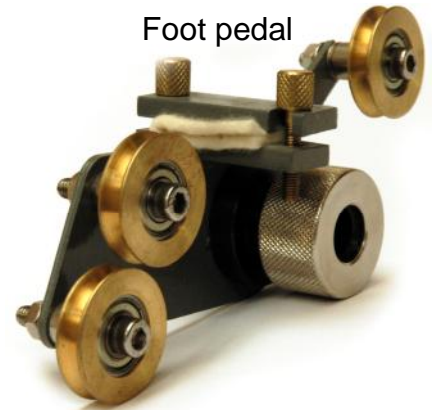
Roller feeder with micro adjustment