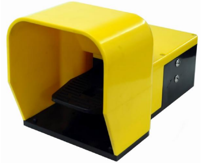
Variable speed foot pedal