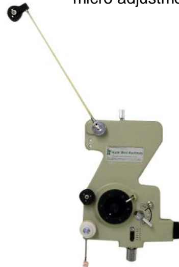
TCL heavy wire tensioner

We aim to be much more than a machinery supplier. Our team has a vast range of winding experience and is able to offer help and advice on all aspects of coil winding, from tooling design to machine choice and set-up.