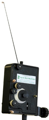
Type "TCS-TCM" tensioner