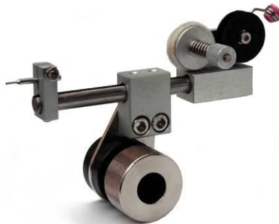
Guide tube feeder head