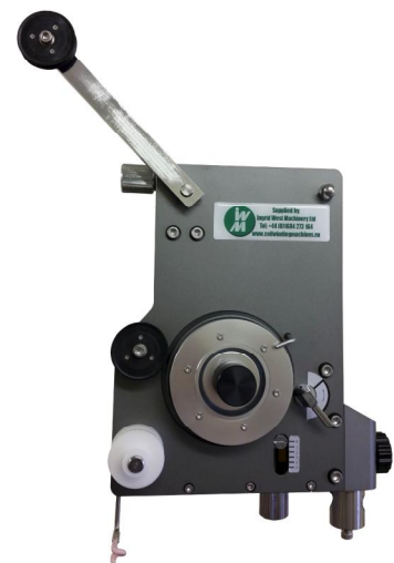
TC3L heavy wire tensioner

We aim to be much more than a machinery supplier. Our team has a vast range of winding experience and is able to offer help and advice on all aspects of coil winding, from tooling design to machine choice and set-up.