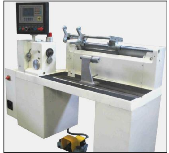
Above: A restored ER-900

Austria, Czech Republic, Germany, Hungary, Poland, Portugal, Romania, Slovakia, Slovenia, Spain, Sweden.