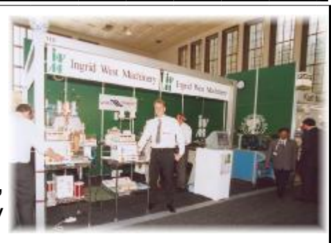
Last year's IWM stand at CWIEME 2002. Berlin.