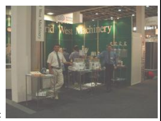
This year's IWM stand at CWIEME 17-19th June, 2003, Berlin, Germany.

Since our last issue of product focus IWM have successfully installed a number of coil and toroidal winding machines throughout Europe. Countries include Finland, Spain, Romania, Czech rep, UK and Germany.