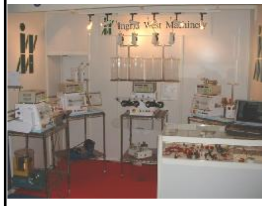
Last year's IWM stand at Productronica 2003