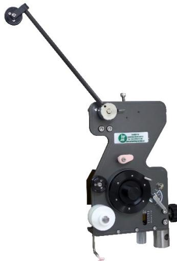
TCL-x heavy wire tensioner