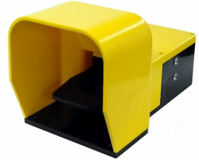
Variable speed foot pedal