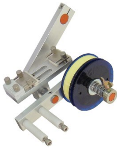
Multi wire feeder head with margin taping