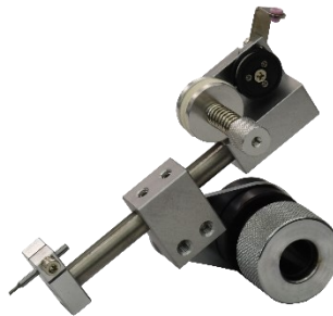
Guide tube feeder head