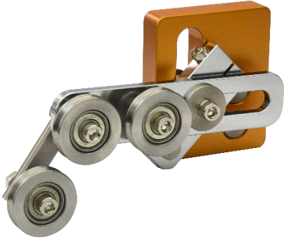
Roller feeder head