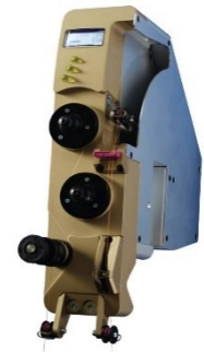
Dual Servo electronic tensioner